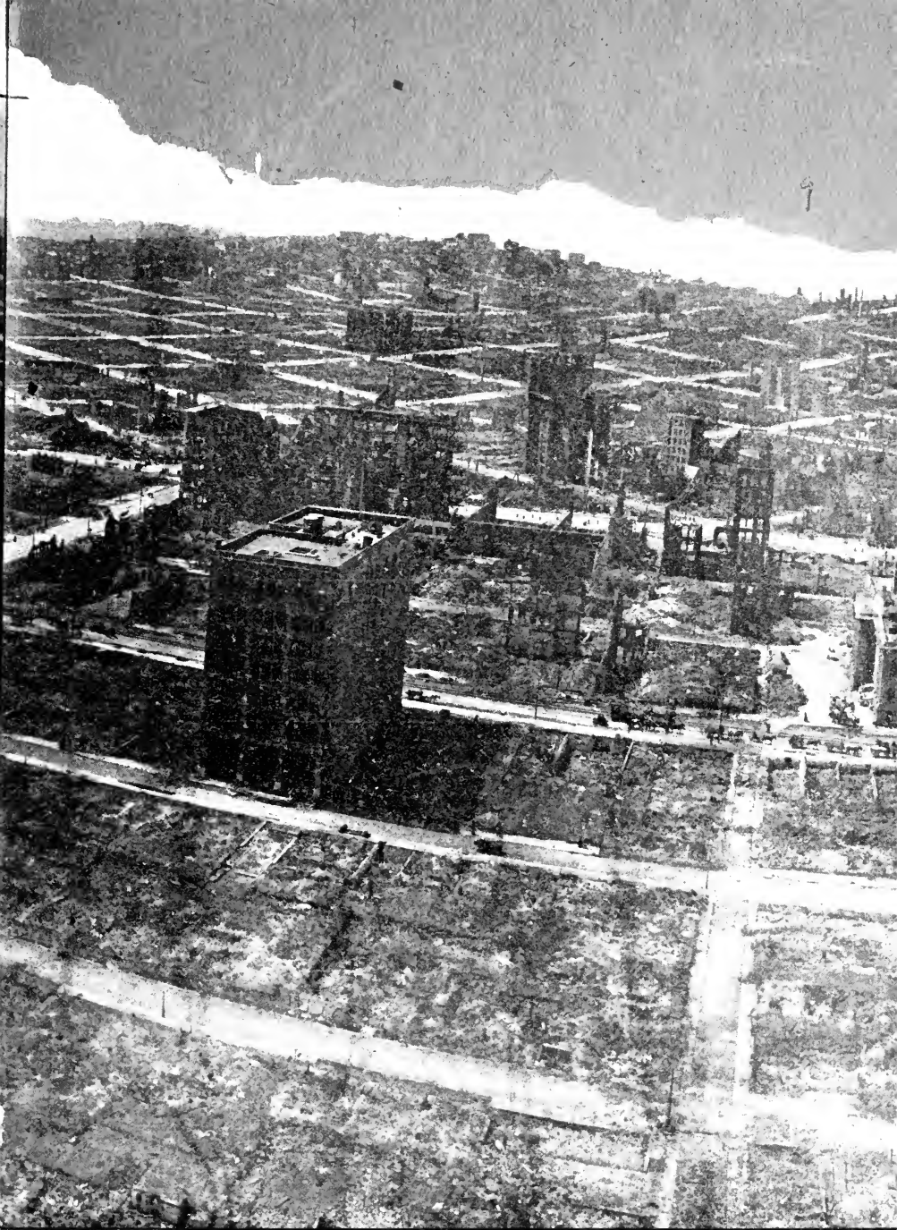
PH OF SAN FRANCISCO, TAKEN APRIL 22ND, 1906, FROM AEROPLANE, SHOWING